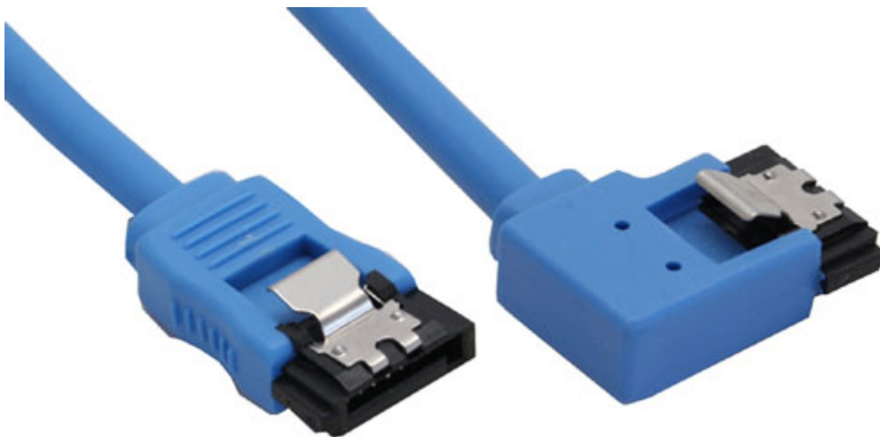
Figure 10: InLine 27703L