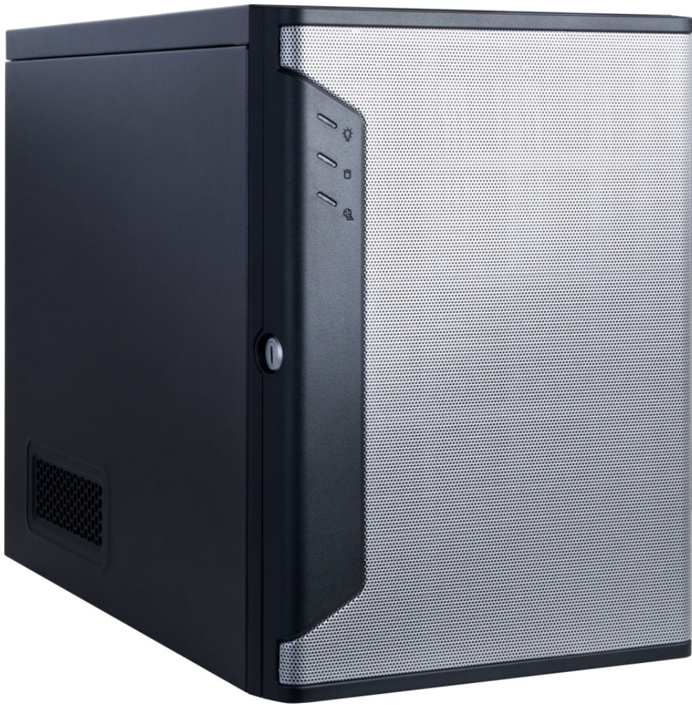
Figure 1: Closed Chenbro SR30169 case