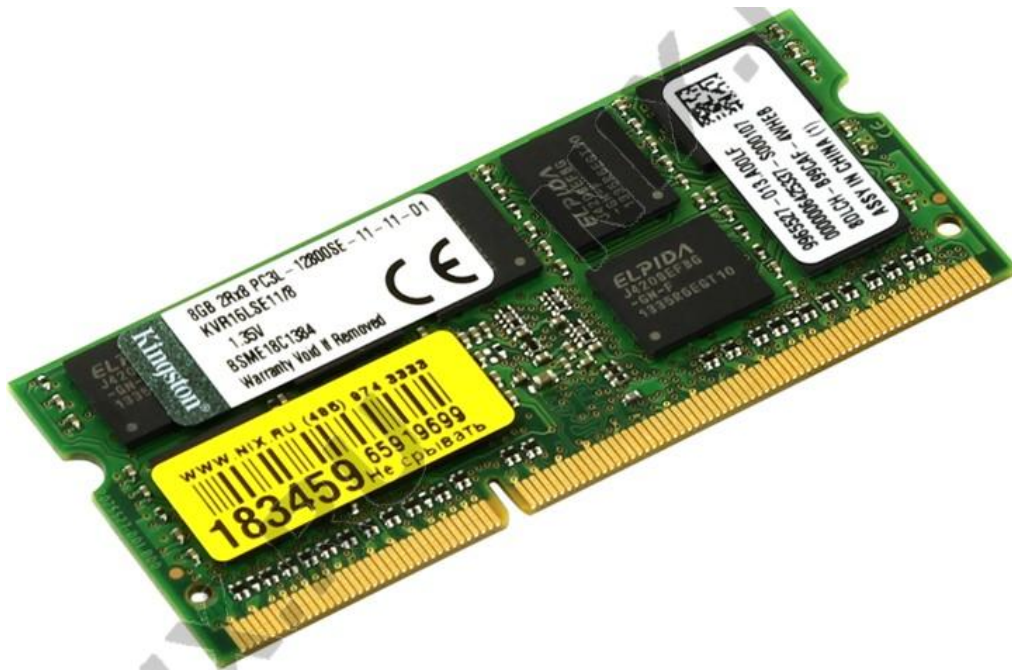
Figure 7: Kingston KVR16LSE11/8

2× Kingston KVR16LSE11/8 8GB PC3L-12800 (1600MHz) CL11 204-Pin ECC SO-DIMM spec sheet