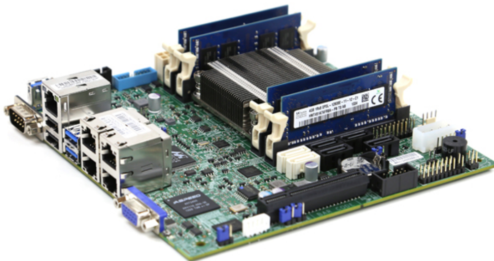
Figure 6: Super Micro A1SAi-2550F side view