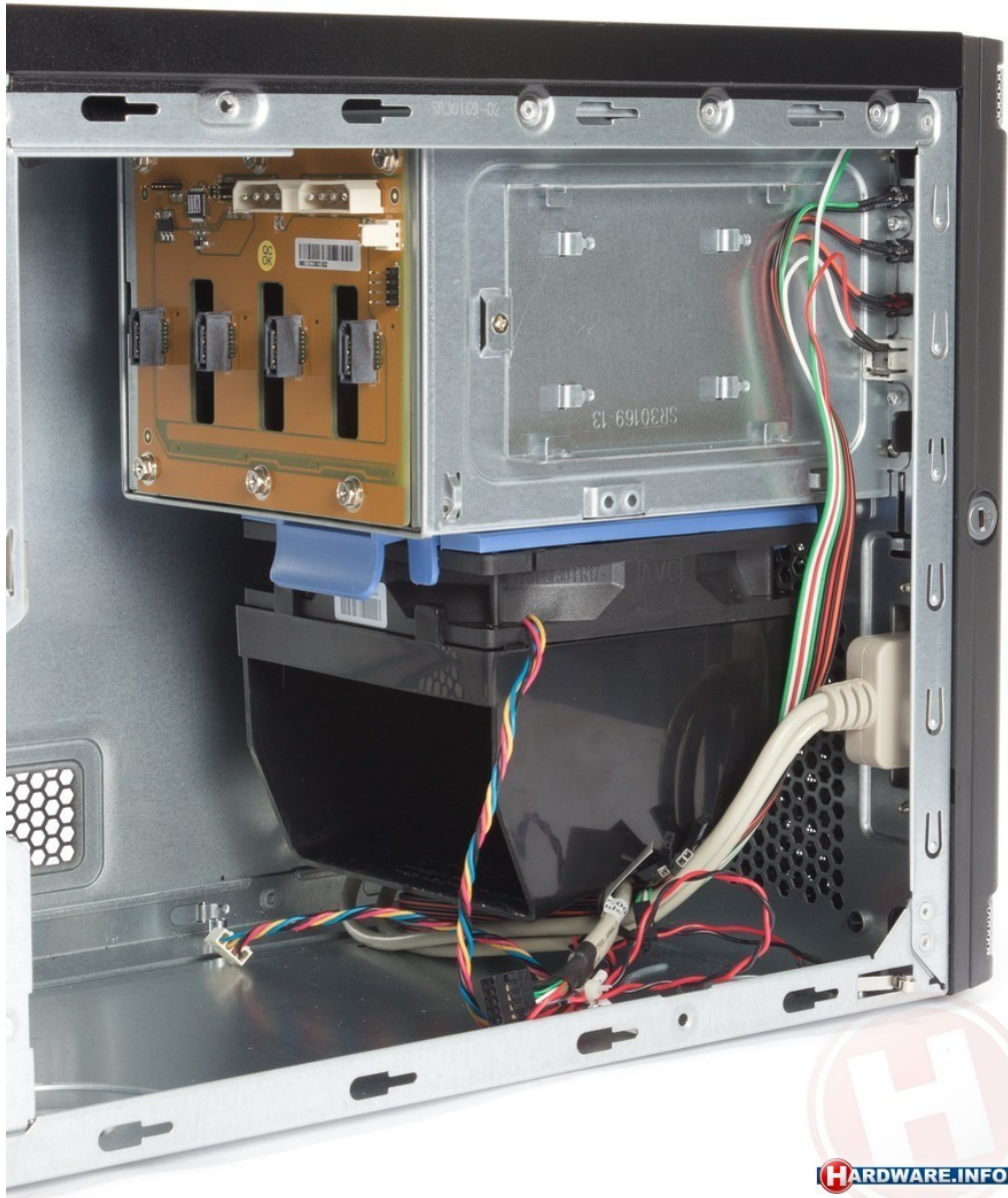
Figure 9: Chenbro SR30169 SATA connections

4× InLine 27703L left-angled 6 Gbps SATA cable, 0.3 m; spec sheet