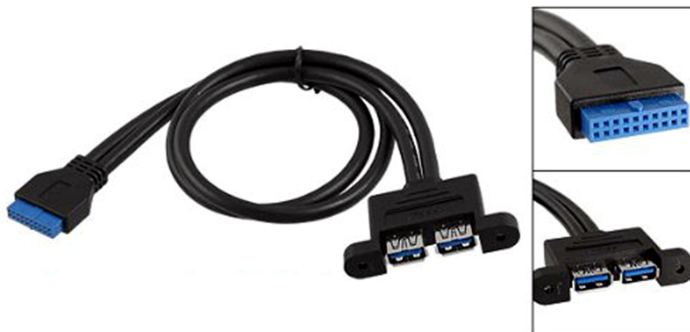
Figure 11: Female 20-pin USB 3.0 internal connector to dual port cable

The case comes with a dual USB 2.0 port at the front. However, the motherboard does not carry an internal USB 2.0 connector. It does feature a 20-pin USB 3.0 connector. There is also a 9-pin COM2 connector which, at first sight, might be mistaken for a 9-pin internal USB 2.0 connector. Luckily, the USB 2.0 cable assembly can be demounted to be replaced by a 20 pin female USB 3.0 internal connector to dual port cable (see picture). Make sure you grab one with the right USB connector separation distance. For the model shown here, I only had to saw off a bit of each lug to make it fit. The original screws and some hot glue keep the connector head in place.