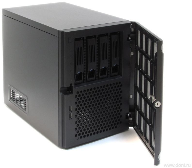
Figure 2: Chenbro SR30169 with opened door