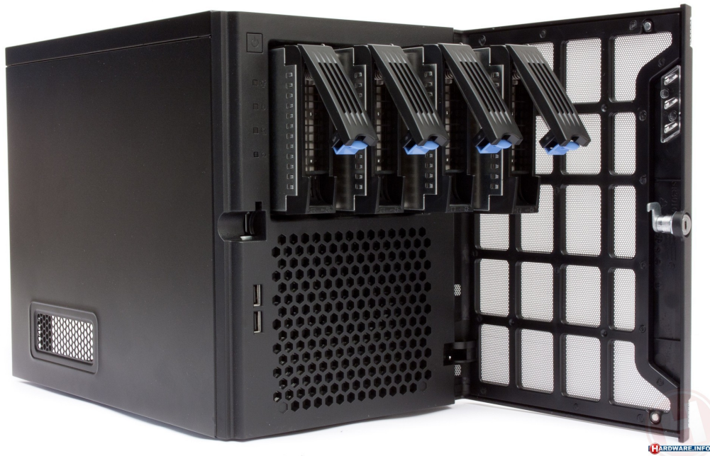
Figure 3: Chenbro SR30169 drive bays