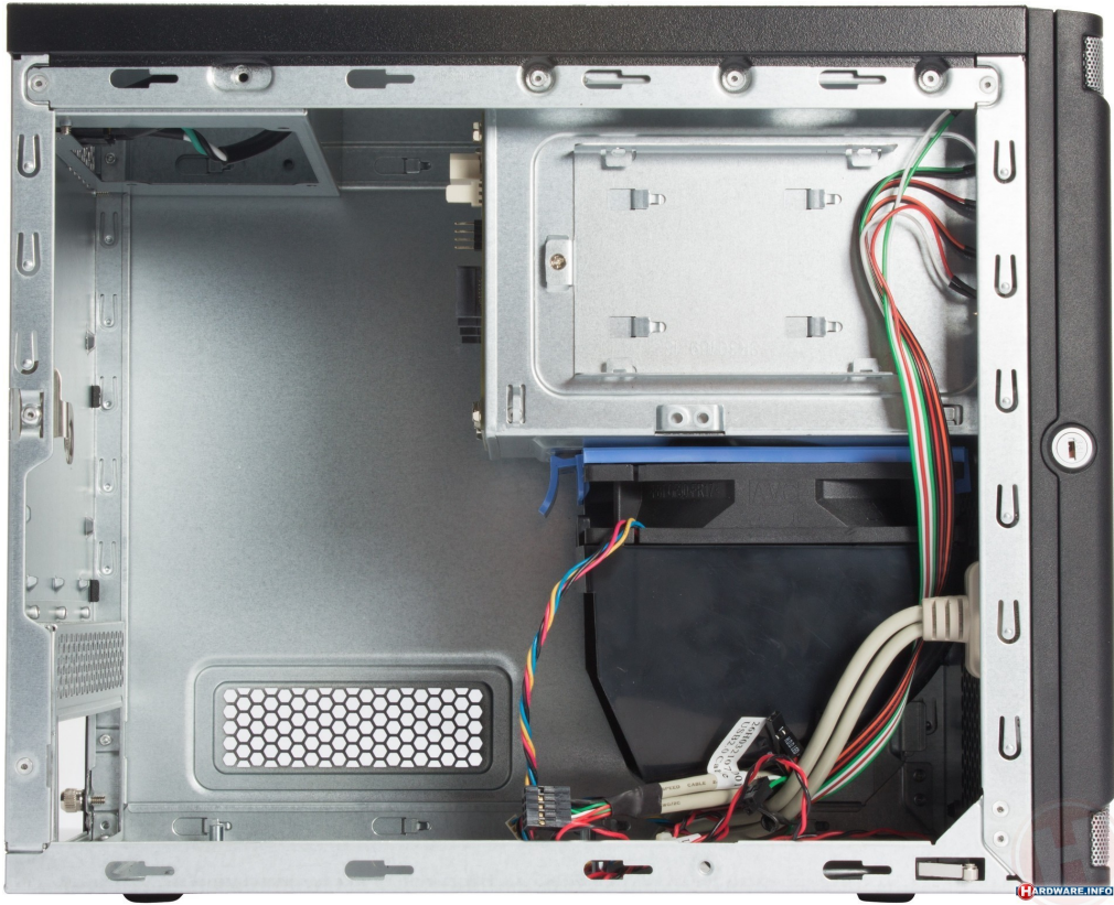
Figure 4: Inside of the Chenbro SR30169 case