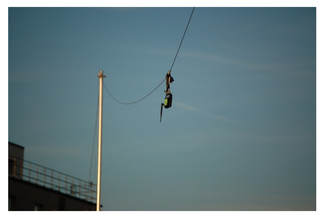
Figure 4: The modified miniVNA PRO hanging from the center of a HF dipole at about 15 m (50 ft) above ground. A balun is not requiered for taking accurate measurements. The VNA can be read from the comfort of my home even though there are quite some 2,4 GHz WLAN signals present in this urban environment. The two 3350 mAh Panasonic NCR18650B Li-ion cells in parallel provide more than enough «juice» for a whole day of measurements.

The miniVNA PRO lacks a hard point to hang it from. Nonetheless, a hanging bracket can easily be made from 3 mm thick aluminium L stock with 30 mm sides. The bracket is held down by the two SMA to BNC connector adapters and stainless steel spring washers at the back (Figure 1). A stainless steel D-shackle and a 30 cm (1 ft) mountaineering sling are used to secure the VNA to the antenna.