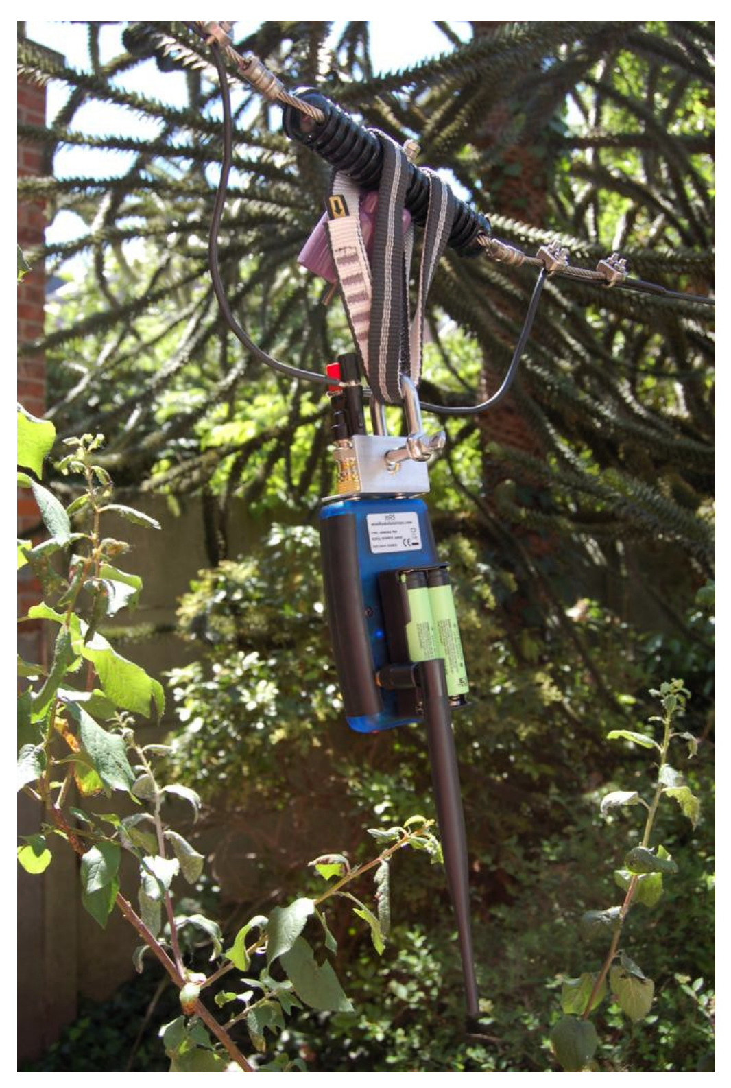
Figure 5: Detail of the modified miniVNA PRO hanging from a lowered wire antenna in my urban jungle. A stainless steel D-shackle and a 30 cm (1 ft) mountaineering sling are used to secure the VNA to the antenna's center insulator. Prior to taking any measurements, the VNA was properly calibrated at the banana terminals.