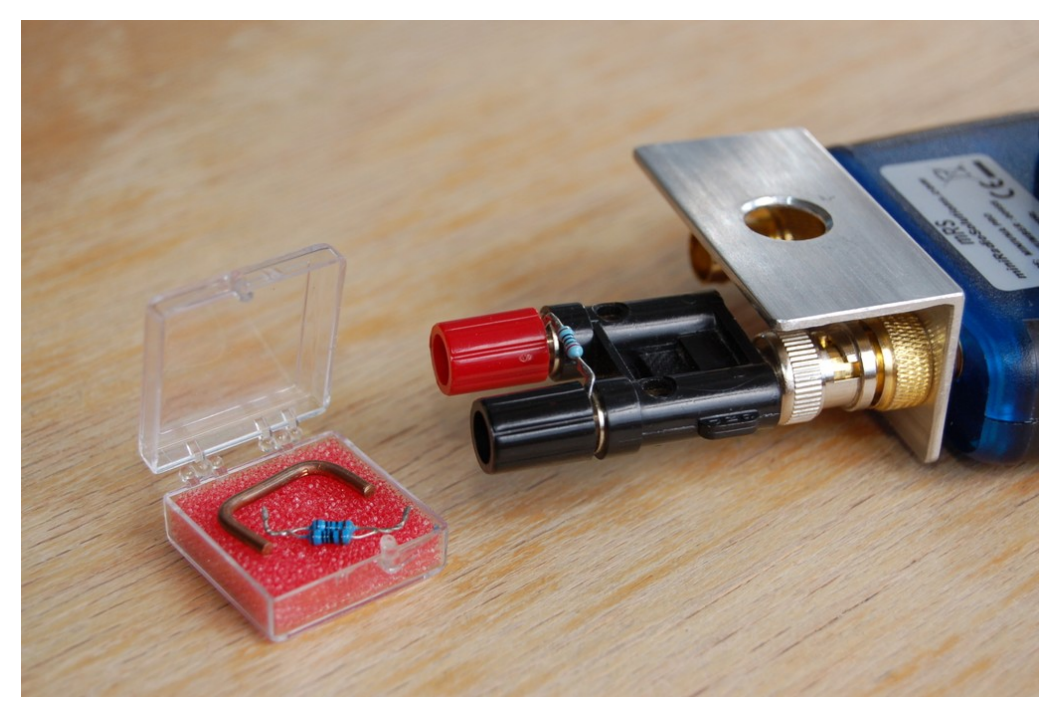
Figure 6: A calibration kit for banana terminals. The tiny plastic box on the left contains a short and a 50 \Omega load consisting of two high-precision 100 \Omega low-inductance metal film resistors in parallel. On the right, a high-precision 200 \Omega low-inductance metal film resistor for measuring components of CL-OCFD antennas.

A BNC to banana terminal adapter turns out to be quite handy for measuring components and antennas. Like any VNA measuring lead, such an adapter requires a SOL calibration kit. SOL stands for short, open and load. Calibration allows for cancelling out the effect of the adapter over a wide frequency range. It will put the measuring plane of the VNA right at the level of the banana terminals.