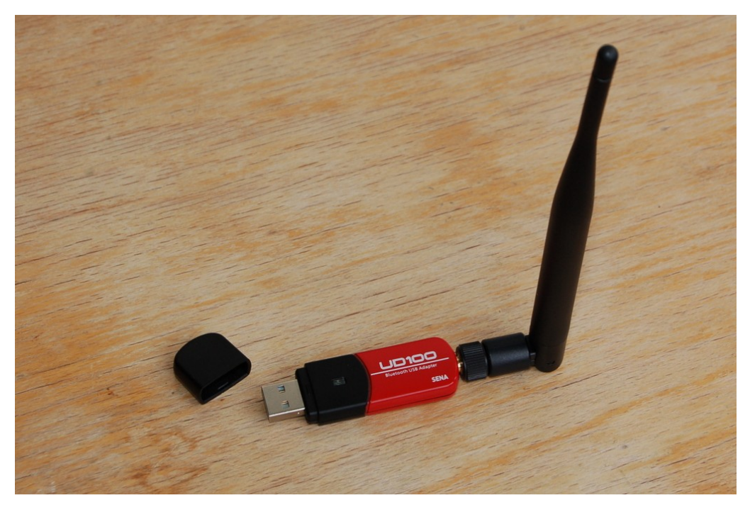
Figure 3: The Sena Parani-UD100 Class 1 (100 mW) Bluetooth 4.0 dongle connected at its RP-SMA port to an aftermarket 2,4 GHz dipole antenna provides an open field signal at a range of up to 600 m.

Good to know: GNU/Linux recognises this Bluetooth adapter right out of the box. There is no need to install any driver. I wrote a separate, detailed article about connecting the miniVNA PRO over Bluetooth using GNU/Linux.