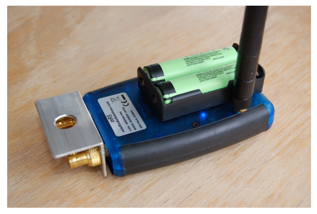
Figure 1: External view of the heavily modified miniVNA PRO showing the external Li-ion battery pack, an external 2.4 GHz Bluetooth antenna and an aluminium hanging bracket held down by two SMA to BNC connector adapters. A steady blue LED is indicative of a stable Bluetooth connection.

The advantage of having an external battery holder is that cells can easily be removed to be charged in a much more reliable and faster Li-ion battery charger, like for example the Nitecore NEW i4.